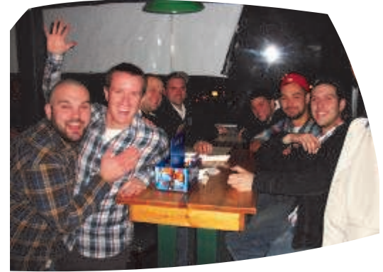
Alumni and undergrads enjoy the festivities of Homecoming Weekend 2010