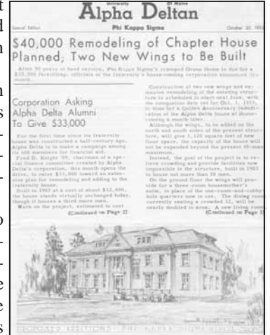
The Oct. 1952 'Alpha Deltan', outlining the proposed wings