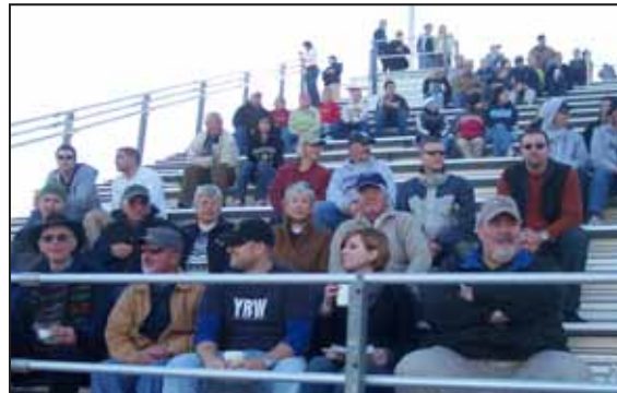
← Alumni and guests enjoy group seats at the Homecoming football game